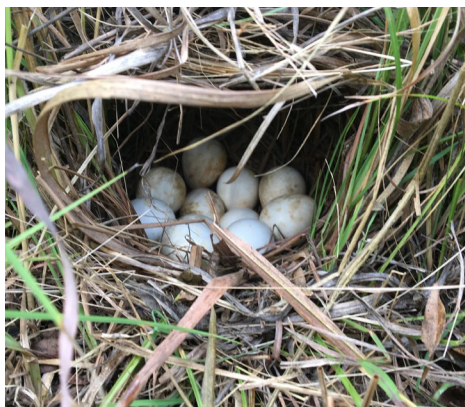
Above: Bobwhite nest found on Ben Geren Golf Course.