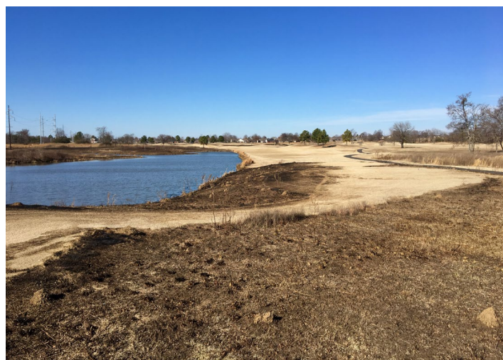
Above Left: Prescribed burn in December 2017 on prairie acres next to a sand bunker; "We really try to blur the edges between golf course and native prairie habitat," says Randolph. Above Right: Post-burn around a tee box complex; "The burn gives us the ability to go back in and seed other grasses or forbs we don't currently have in those areas. Also, switching to native vegetation around the tee complexes helps us reduce water use."