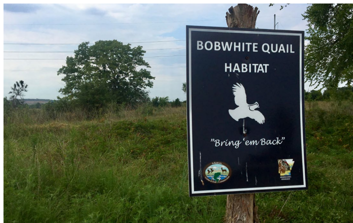
Above: Bobwhite habitat restoration sign at Ben Geren Golf Course.

Randolph is adamant: "Every single golf course has some acres they can put into this kind of management," Randolph asserts. Translated into the NBCI regional context, it means approximately 9,600 golf courses in the 25 NBCI states with an average size of 150 acres, or approximately 1.45 million acres. Sixteen percent of those acres, on average, are in "rough." That's 232,000 easily accessible acres that draw thousands of visitors each year.