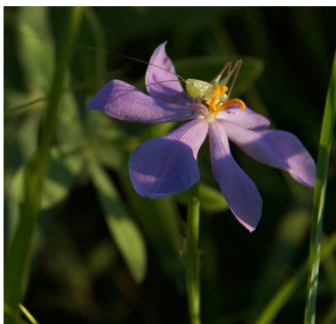
Above: Nuttall's pleatleaf, a plant of conservation concern in Arkansas.

departments from Barling and White Bluff, and began hand-seeding the acreage with prairie seed collected in 2016. This year, he not only collected seed again from the virgin prairie remnants outside the golf course, but also transplanted about 60 plants from a virgin area that was being developed as a subdivision. Among the species were Nuttall's pleatleaf, pink milkwort, and Oklahoma grasspink orchid, all rare.