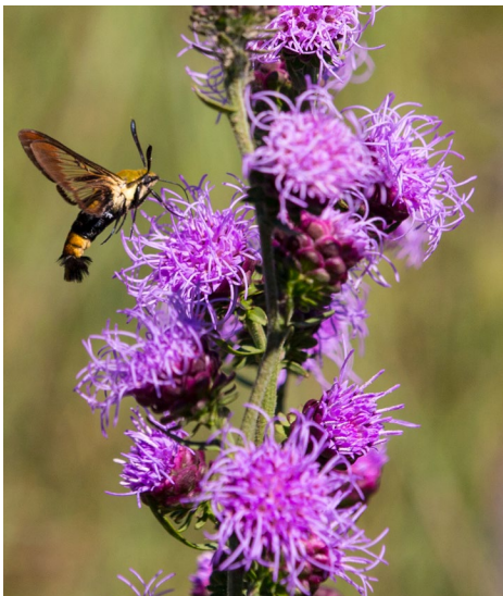
Left: Swallowtail butterfly in the early morning light. Center: Gulf fritillary butterfly, whose butterfly uses the Passionflower vine as a host plant. Right: Hummingbird moth pollinating rough blazingstar. In addition to attracting pollinators, these forbs and native plants bring in many small insects for bobwhite chicks.