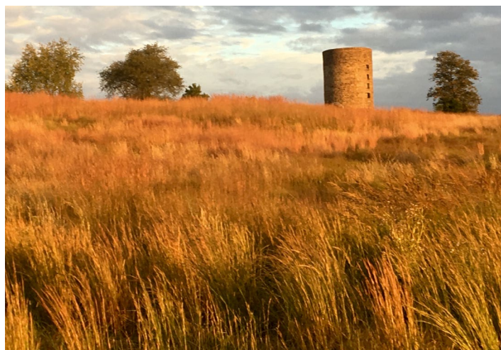
Above: Prescribed fire is applied to the area around The Silo, which was built in the 1880-90s and is the namesake for the "Silo 9" holes of golf. The site was the first documented farm in Arkansas to use bermudagrass as forage for livestock.