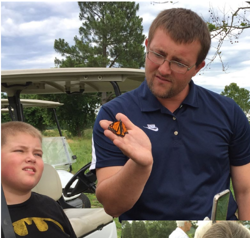
Left: Western Arkansas Master Naturalists coordinated a butterfly walk in the Massard Prairie Reestablishment Areas this summer as part of National Pollinator Week.