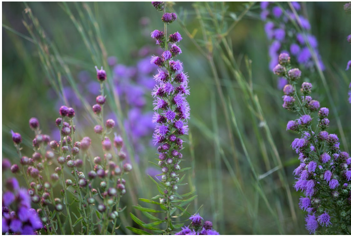
Above: Rough blazingstar blooms in late summer/early fall, attracting a whole host of pollinators when not much else is blooming. Below: Prairie blazingstar in bloom.